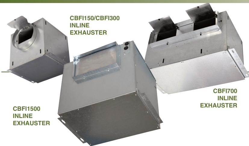
CBF150/CBF300 INLINE EXHAUSTER